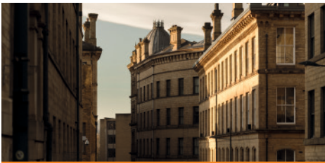
14 Little Germany

Lister Park, Bradford BD9 4NS www.bradfordmuseums.org