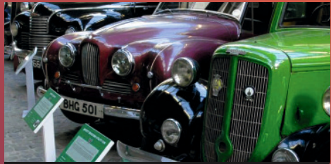
Bradford Industrial Museum

North Park Road, BD9 4NS www.bradforddistrictparks.org