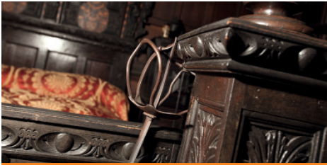
Bolling Hall Museum

One of Bradford's oldest buildings, with connections to the Royalists during the Civil War. Now a museum, it showcases the house's 500-year history.